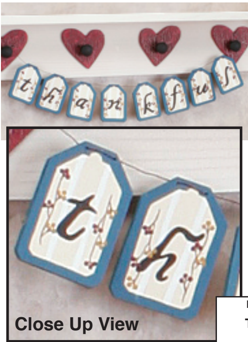
Close Up View

( ) = Available from The Winfield Collection, 1-800-946-3435